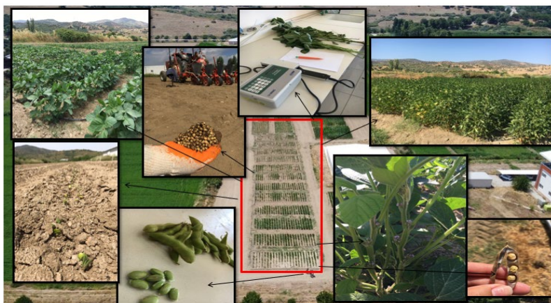
Figure 1. Location and general view of field experiment

The field experiment was conducted during the 2020 and 2021 growing seasons in the experimental area, situated at 37°45'N 27°45'E on the Aydin Adnan Menderes University Faculty of Agriculture Research and Application Farm (Figure 1). In order to evaluate the yield and quality characteristics of soybean in the experiment, two mid-early soybean varieties (Cinsoy and Altinay) were provided as material from Aegean Agricultural Research Institute, Izmir. In the experiment, two Rhizobia bacterial materials were used for inoculation to soybean seeds. These materials were AZOTEK-2 ( Rhizobium spp. ) inoculant obtained from Ankara Soil, Fertilizer and Water Resources Central Research Institute and USDA 110 inoculant containing Bradyrhizobium diazoefficiens obtained from Humboldt-Universität zu Berlin, Germany.