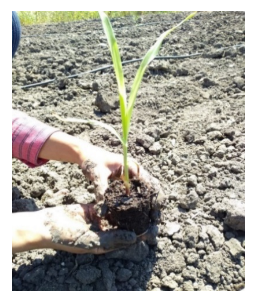
Figure 2. Planting D<sub>0</sub> plants in the field (original).

In the second year of the study, seeds considered haploid were germinated at 23°C in a dark climate chamber for chromosome doubling treatment. Since seeds with a haploid embryo include a typical triploid (3n) endosperm, they germinate similarly to seeds like a diploid embryo (Coe and Sarkar, 1964). Colchicine was applied 2-3 days after germination (at the coleoptile stage). The tip of the coleoptiles was cut off and immersed the whole seedling in a 0.06% colchicine solution plus 0.5% DSMO (dimethyl sulfoxide) for 12 h at 18°C (Gayen et al., 1994; Deimling et al., 1997). The seedlings were carefully washed in water after receiving the colchicine treatment. After they were grown in a greenhouse until they had five to six leaves. Then, the plants were transferred to the field a few weeks later (Figure 2). Self-pollination was performed on the first generation of doubled haploid plants (D_0) .