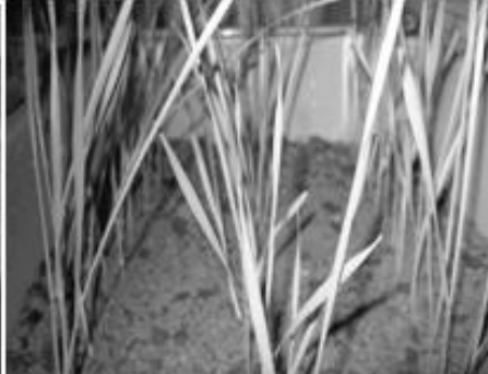
Figure 1. Stages of freezing test based on Mahfoozi et al. (2001).