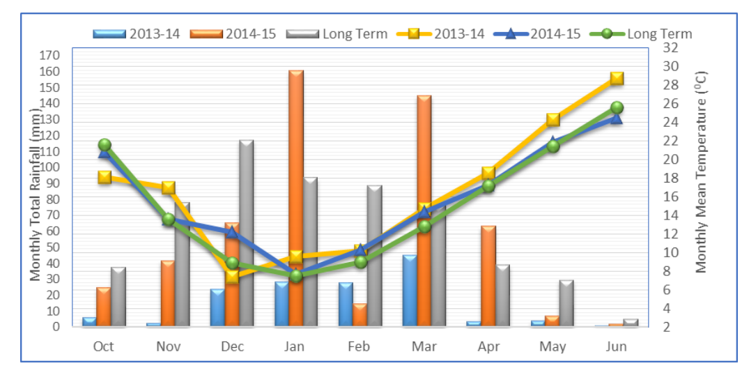
Figure1. Monthly mean air temperature and total rainfall during the study and long term data (means of 20 years)

The field trials were conducted during consecutive two growing seasons (2013-14 and 2014-15) at Agricultural Research Station of Mustafa Kemal University, Hatay province in the Eastern Mediterranean regions of Turkey (located at 36° 15' N). The soil of experimental area had clay soil with pH of 7.12, 6.45% CaCO3, 74.1 kg ha<sup>-1</sup> phosphorus, and 1.93% organic matter at the depth of 30 cm. The region has typical Mediterranean climate with hot-dry summers and mild-rainy winters and climatic data of the location during the experiment period were summarized in Figure 1. There were quite drought and higher warm conditions according to normal climatic conditions in the first year of the experiment, but in the second year of the experiment, especially during the January, March and April much rainfall occurred.