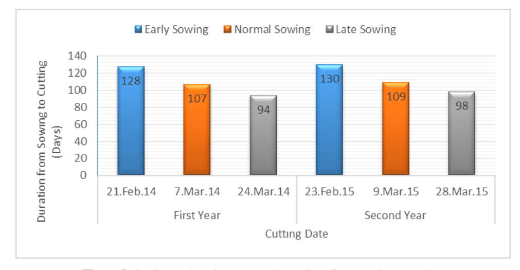
Figure 2. Sowing and cutting dates and durations from sowing to cutting

cutting were shown in Figure 2. To harvest for forage, plants were cut with scissors to a stubble height of 5, 7.5 and 10 cm at jointing stage of wheat (Zadoks 31). After measuring fresh forage yield, 500 g green forage sample from each treatment was taken and then they were dried at 65 °C for dry matter determinations. Dried samples were ground in a mill to pass a 1 mm screen for chemical analysis. Harvest and sampling for grain were made on 3 June 2014 and 8 June 2015. After threshing and harvesting cleaned grains were weighed with an electronic scale and converted into grain yield kg ha<sup>-1</sup>. Also, 1000 seed weight and hectoliter weight were determined from these samples. Before the harvest, 10 spike samples were taken from each plot to determine spike length, spike weight, grain number per spike and grain weight per spike. 100 g grain sample was ground in a mill to pass a 1 mm screen for nitrogen analysis.